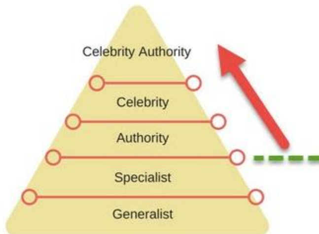
Expert Chart: Serve above the green line!