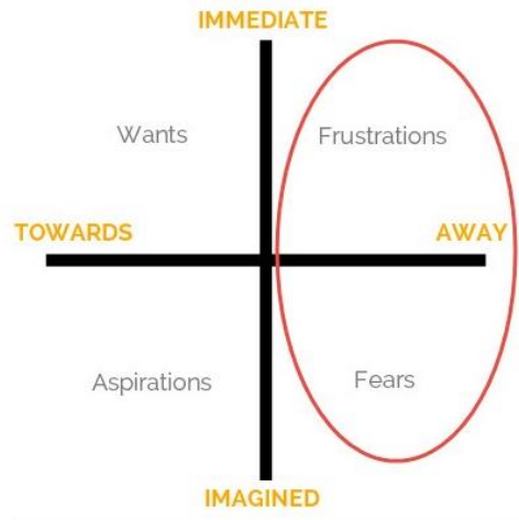
Quadrant Figure: Writing copy for your prospect's why. Who are you to them under this model?

Broadcast sources: https://chaosmap.com/blog/facebook-ads-chiropractors/